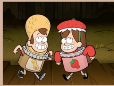
Uh, actually, I'm not dressed up as anything.