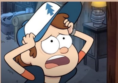
I heard a ruckus.