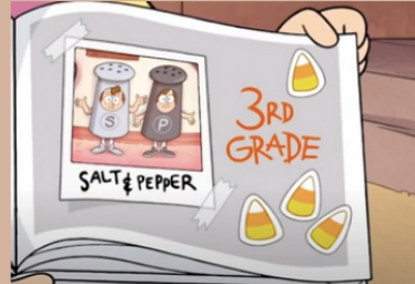
Me and Dipper were kind of the kings of trick-or-treating.