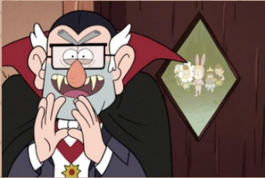
They're gonna run away screaming from Stan Pines, Master of Fright!

1 Language guess. Guess the meaning of the words in bold according to contexts and situations in the cartoon.