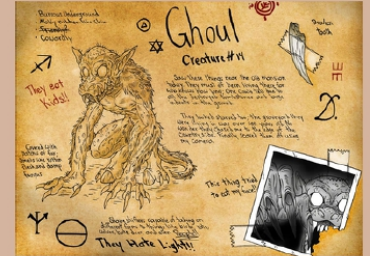
It's a night of ghouls and goblins.